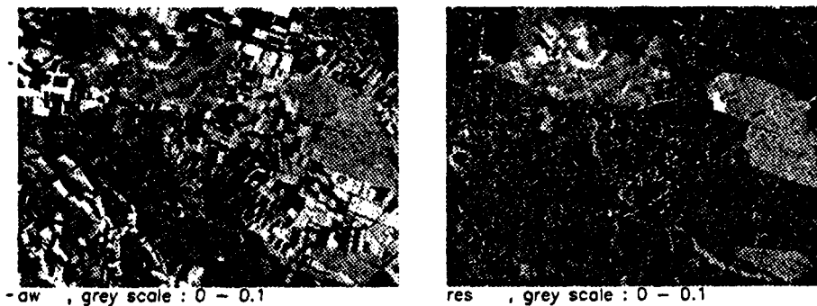
Figure 1. The water parameter (left) and the residual amplitude (right) over the Freiburg test site ; the brighter areas in the residual image are the forested zones.

Figure 2 shows the residual amplitude over a small fraction of the Black Forest which is completely composed of conifers, Norway spruce being the dominant species. When compared with an age class map, a positive correlation of the residual amplitude with the forest age can be distinguished.